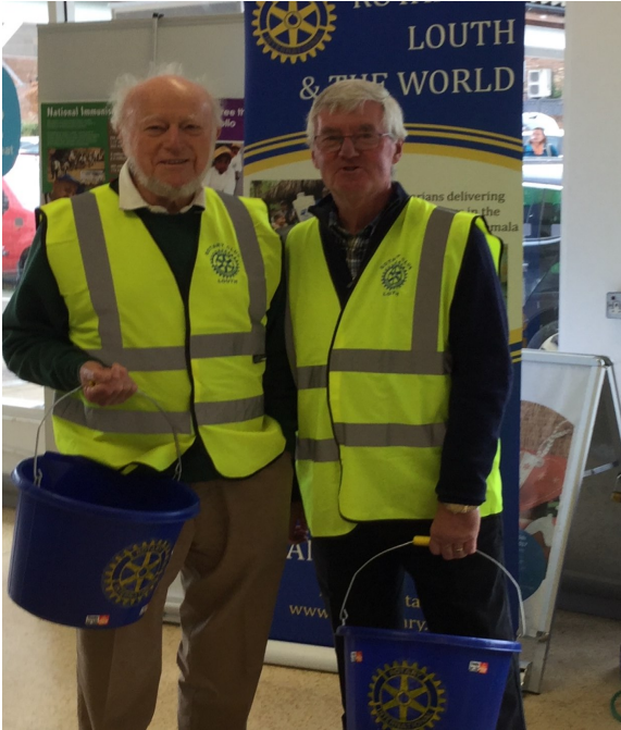
Lucky Louth Rotarian's Diamond Jubilee of Rotary Service