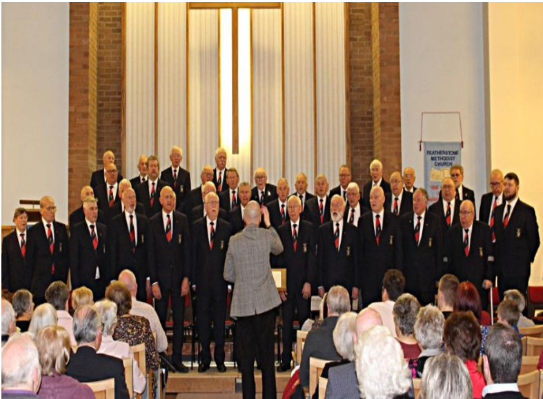
Normanton Rotary's choir fund raiser for local hospices