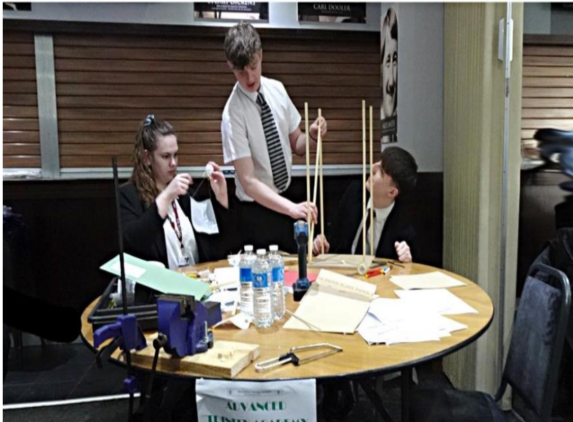
Normanton Rotary's report on the Joint 10 Technology Tournament